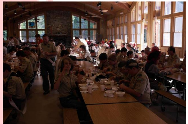
Everybody enjoying an excellent meal