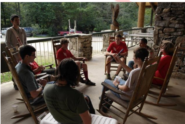
The drum team practicing Saturday afternoon