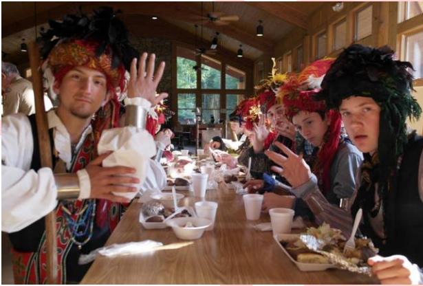
The dance team before Saturday night's performance