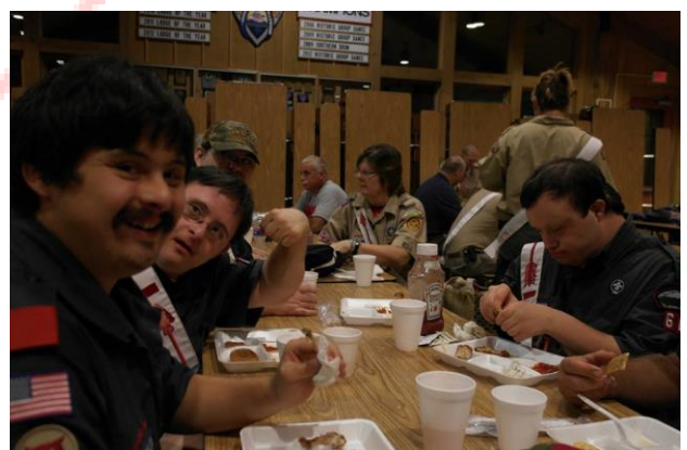
Brothers enjoying the cracker barrel