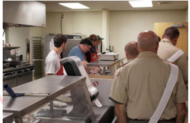
The kitchen crew serving up a delicious meal