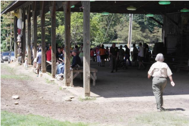
The Ordeal candidates taking a lunch break during a hard day's work