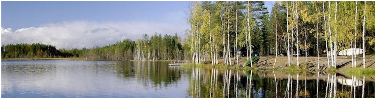
Lake Murray, Camp Barstow - Home of the 2017 SR5 Dixie Fellowship